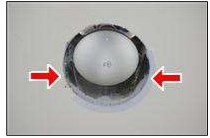
15.4 Picture 1

15.4 One recessed light fixture at living room ceiling.