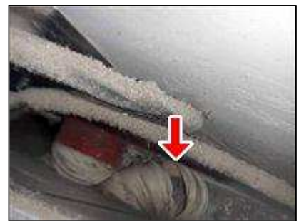
11.15 Picture 1

The kitchen and laundry appliances in the home were inspected and reported on with the above information. While the inspector makes every effort to find all areas of concern, some areas can go unnoticed. Washing machine drain line for example cannot be checked for leaks or the ability to handle the volume during drain cycle. Please be aware that the inspector has your best interest in mind. Any repair items mentioned in this report should be considered before purchase. It is recommended that qualified contractors be used in your further inspection or repair issues as it relates to the comments in this inspection report.