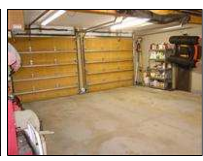
Styles & Materials