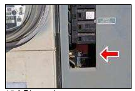
15.2 Picture 1

15.2 Some knock-outs in the dead front (cover of the main panel) were missing. This is not a proper repair and is considered a safety hazard as live components of the electrical system are potentially exposed. While this is not a difficult repair, I recommend that the work be done by a qualified electrician to prevent injury/electrical shock.