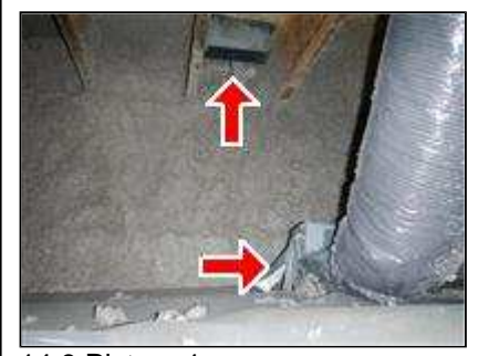
14.9 Picture 1

14.9 One duct in crawlspace was detached. Minor repair