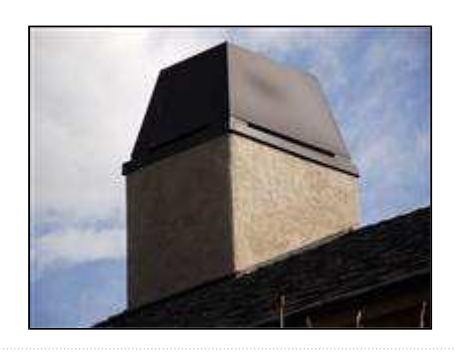
Styles & Materials

Number of Chimneys: Chimney Structure: Chimney (exterior): One Wood framed Cement stucco