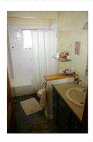
Styles & Materials

Countertop(s):Floor:Ventilation:LinoleumSlateCeiling fan and operable window