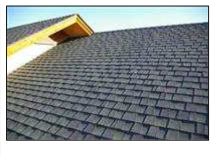
Styles & Materials