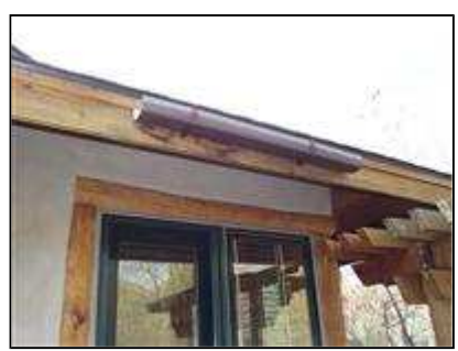
2.5 Picture 1 Gutter without downspout at north entry

The roof of the home was inspected and reported on with the above information. While the inspector makes every effort to find all areas of concern, some areas can go unnoticed. Roof coverings and skylights can appear to be leak proof during inspection and dry weather conditions. Our inspection makes an attempt to find a leak but sometimes cannot. Please be aware that the inspector has your best interest in mind. Any repair items mentioned in this report should be considered before purchase. It is recommended that qualified contractors be used in your further inspection or repair issues as it relates to the comments in this inspection report.