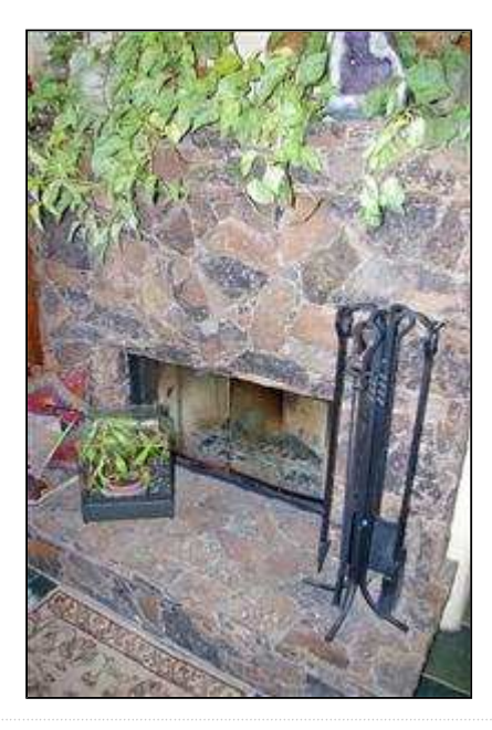
Styles & Materials

Number of Fireplaces:Hearth:Mantle:OneStoneStone