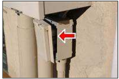
15.6 Picture 1

15.6 GFCI outlet at main electrical panel had a detached cover. Minor repair