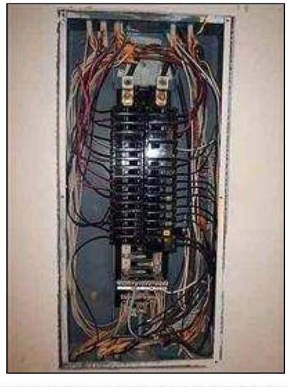
Styles & Materials

Service Entrance Cable/Conduit/Location: