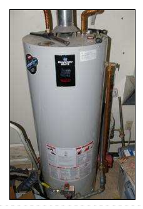
Styles & Materials

The home inspector shall observe: Hot water systems including: water heating equipment; normal operating controls; automatic safety controls; and chimneys, flues, and vents.