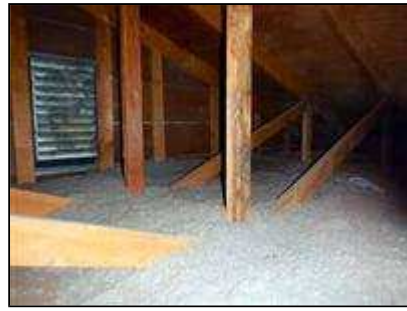
Styles & Materials

Attic Access/Location: Master bedroom closet