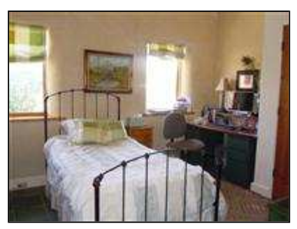
Styles & Materials