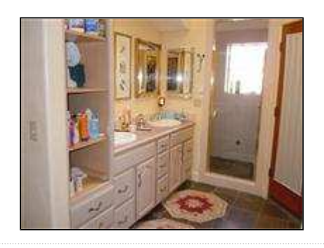
Styles & Materials

Countertop(s):Floor:Ventilation:LinoleumSlateCeiling fan and operable window